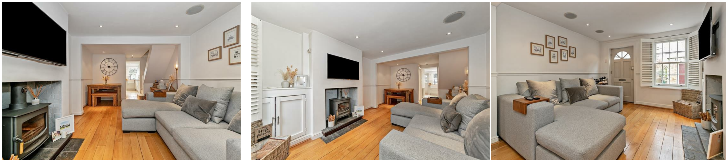
Ground Floor Approx. 328.6 sq. feet

This charming two bedroom Victorian cottage in one of the city centre's prime cul de sac's has been tastefully refurbished throughout yet retains much character, including a feature fireplace with wood burning stove and sash style windows and shutters. The property has very well presented accommodation comprising: an open plan lounge/diner, a contemporary re-fitted kitchen with solid wood work top surfaces, a feature stable door to a south west facing garden, two double bedrooms upstairs and a fully refurbished ground floor shower room. Within seconds walk of Verulamium Park down the hill with its lakes and walks and or up through the park towards the nearby Cathedral and into to the heart of the city centre with all its restaurants, quirky shops and nightlife. You can see the Cathedral from the front, just through the trees and lie in bed listening to the bells on a Sunday morning.